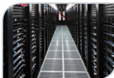
Telecom base station